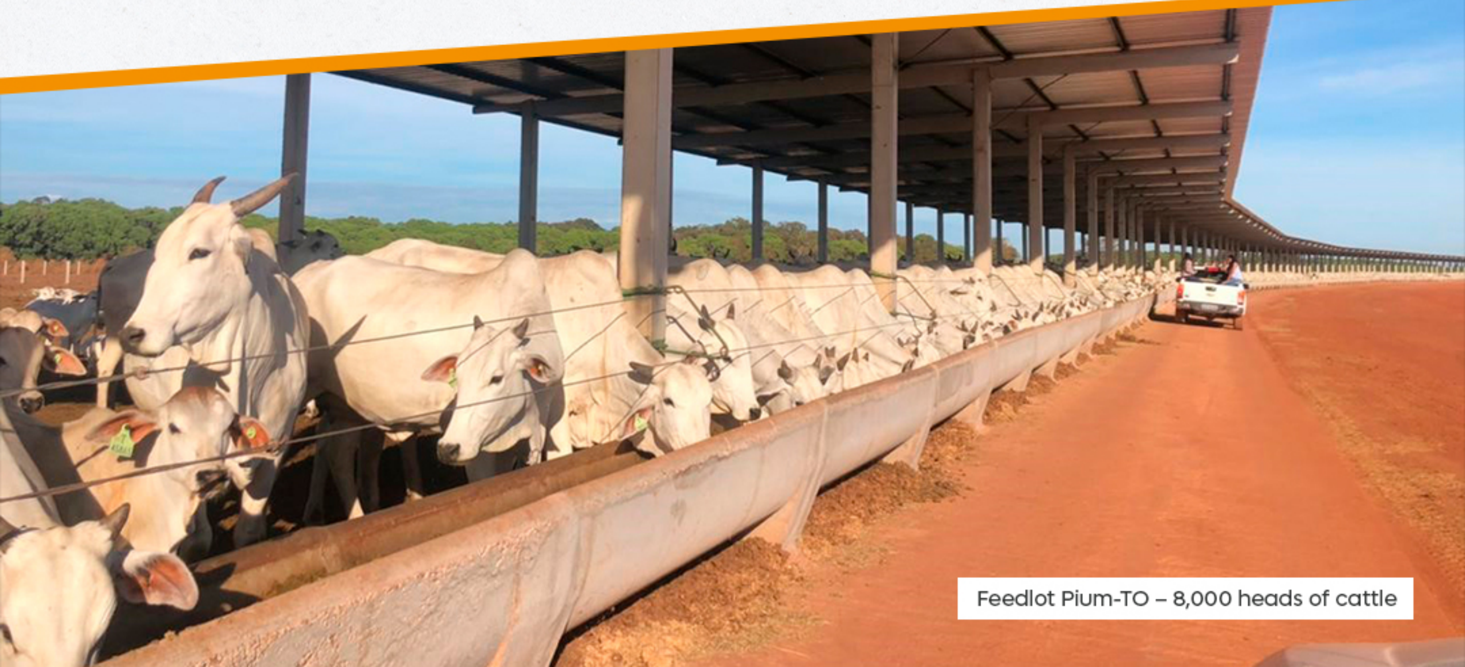
Feedlot Pium-TO – 8,000 heads of cattle

"Created in 2005, Alcance Rural Planning and Consulting aims to provide agricultural consulting services, making its clients more competitive in their activities."